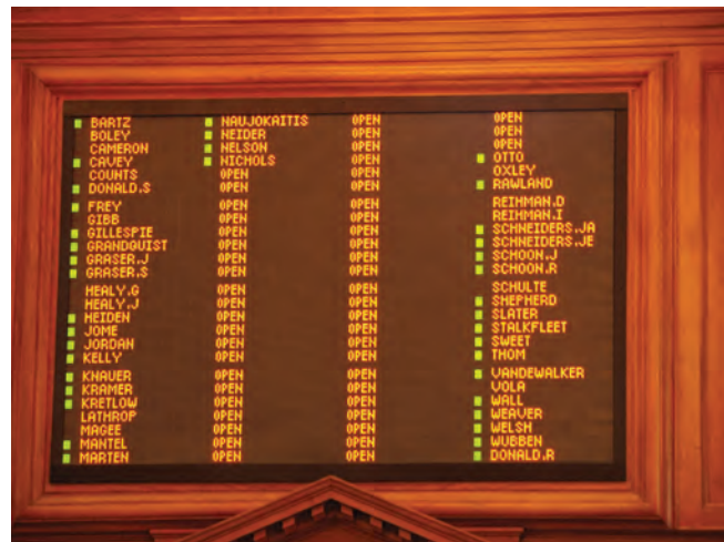
Above, Delegates got to see their names lit up as they cast ballots during the OIL session.