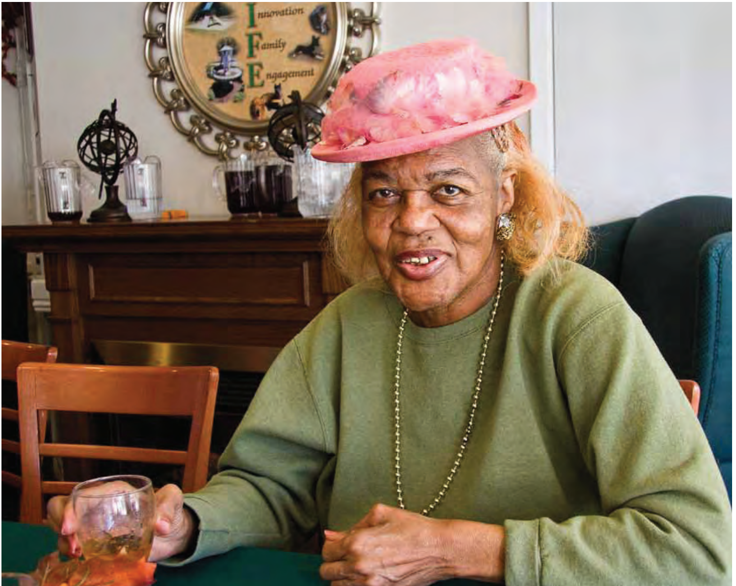
Six women at this Silverado Senior Living residential Alzheimer's community in Texas, USA, were taken by staff members to a flea market to select and purchase a hat. The next day a special table was set for them in the dining room. Each woman arrived, sporting her new hat or was helped to put it on. They all had a good time.

The effectiveness of health systems in identifying people with dementia depends upon the potential consumers, as well as the providers of health and social care. Encouraging help-seeking by raising awareness of dementia is an essential component of any comprehensive strategy to close the treatment gap. However, increased demand needs to be met by adequately prepared and resourced services, trained and able to make accurate diagnoses in a timely and efficient manner, and to ensure that the diagnosis leads seamlessly to the provision of evidence-based care. While acknowledging the importance of promoting demand for services, the focus for this chapter is upon service responses.