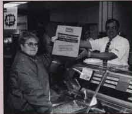
Volunteering to deliver holiday meals