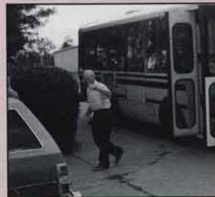
Transportation to centers