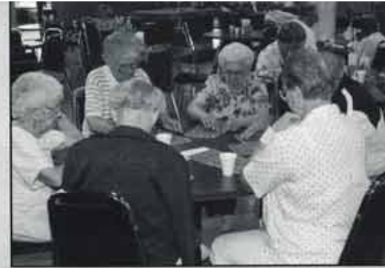
Nutrition and other Educational Programs