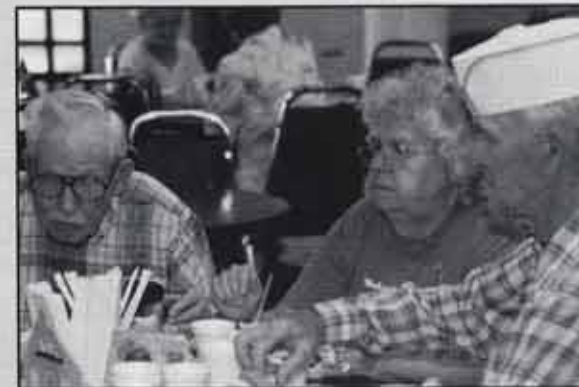
Having Lunch with Friends

A private non-profit agency serving the counties of Boone, Dallas, Jasper, Madison, Marion, Polk, Story, and Warren